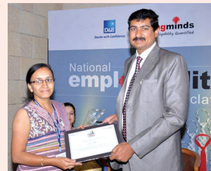
Placement officer receiving Career Guru Award - 2012