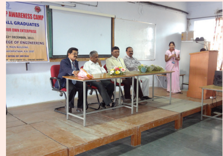
Dignitaries on the dias