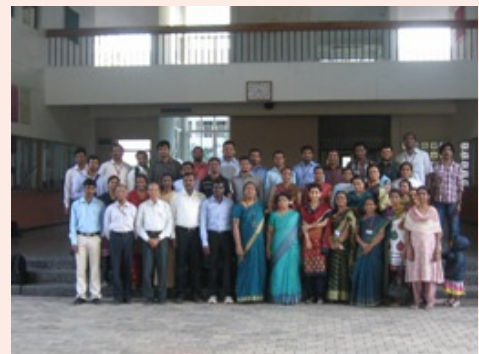
The Participants in the workshop